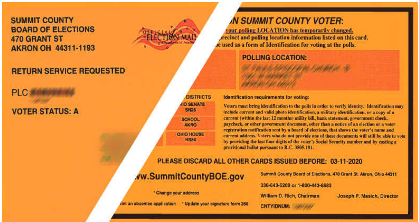
Polling location change card sample front side on left, back side on right.

Please check the Board's website or social media pages for updates to this press release.